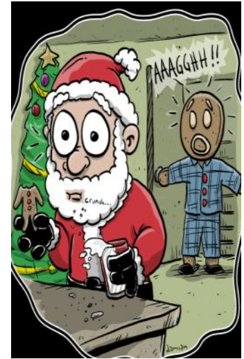
Santa visits The Gingerbread Family

No, no NO! PLEASE never turn off your thermostat during the winter; your water pipes may freeze and rupture, causing considerable damage to your and your neighbors' apartments. Please set your thermostat NO LOWER than 50 degrees while you are away.