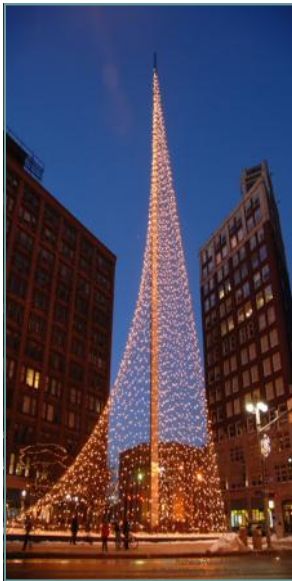
Liberty Pole, Downtown Rochester