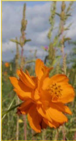
The Wildflower Meadow