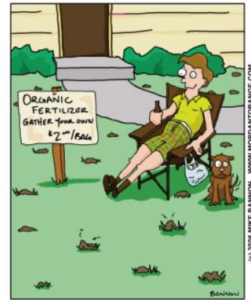
A Village resident gets creative about the Poop Problem

“Can I bring a guest to the pool?” YES! You can bring 2 guests with you, but be sure to bring your pool pass!