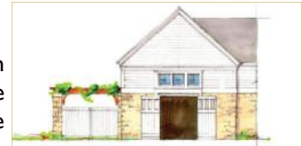
Entrance Door Study

May and June, and 8am until 9pm through the summer. A final schedule will be distributed sometime in May, along with your pool passes and a copy of our Pool Rules.