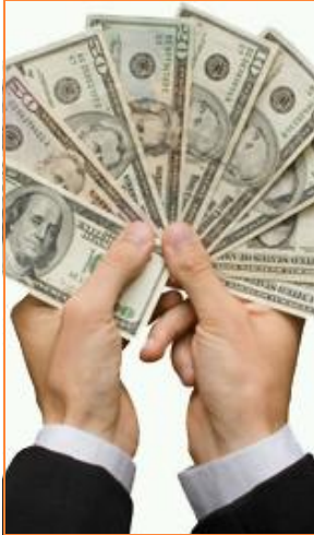
Deal me in...