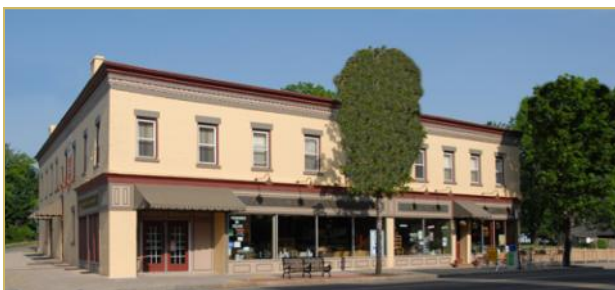
The Abeles Building