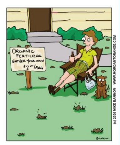
A Village resident gets creative about the Poop Problem

"Can I bring a guest to the pool?" YES! You can bring 2 guests with you, but be sure to bring your pool pass!