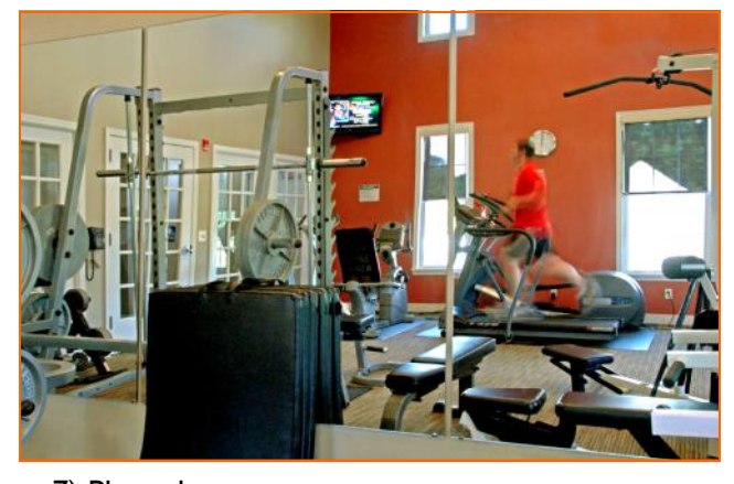
7) Please be sure to report any equipment malfunctions to us as soon as you discover them.

6) Be sure to use the safety stops on the smith machine.