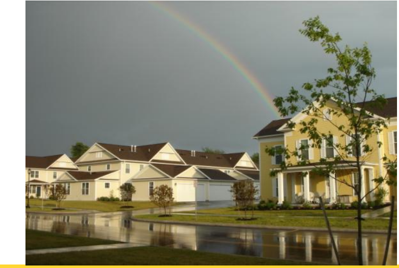
Photographers, feel free to submit shots of Erie Station Village to be featured here...